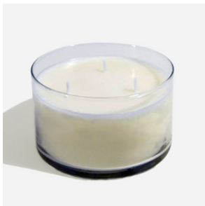
4" Coconut Wax Candle