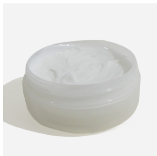
8 Ounce Body Frosting