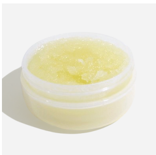
8 Ounce Sugar Scrub