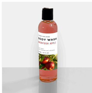
8 Ounce Shower Gel