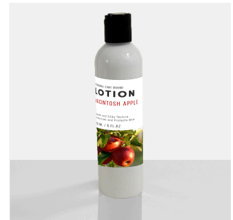
8 Ounce Lotion